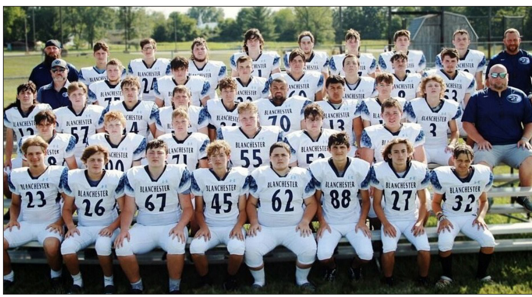
The Blanchester High School football team will open its 2024 season Aug. 23 against Paint Valley at Barbour Memorial Field.

The Hurricane had wins over four playoff teams but lost in the post-season to Bellbrook 48-0.